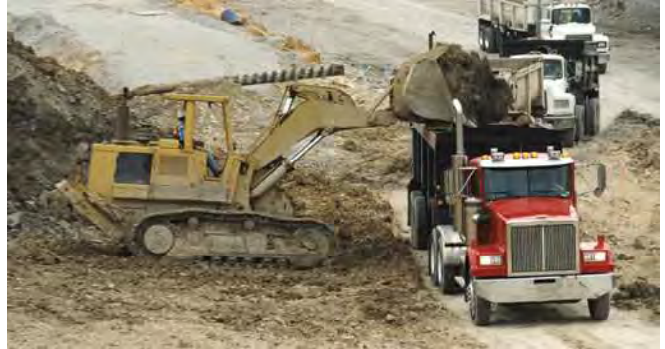
SWEPACO 306 provides superior protection and cost efficiency in demanding trucking, mass transit, mining, construction, manufacturing and municipal services applications ... mobile or stationary ... diesel or gasoline.

SWEPACO 306 Supreme Formula Engine Oil is a premium quality, multi-purpose, extended service engine oil specially formulated to provide superior performance under the most demanding operating conditions. Its multi-grade all-season formula means you can lubricate your entire fleet, even new engine designs, year-round, with SWEPACO 306. It provides outstanding wear control, service life, cleanliness, thermal stability and corrosion resistance for most diesel and gasoline engines.