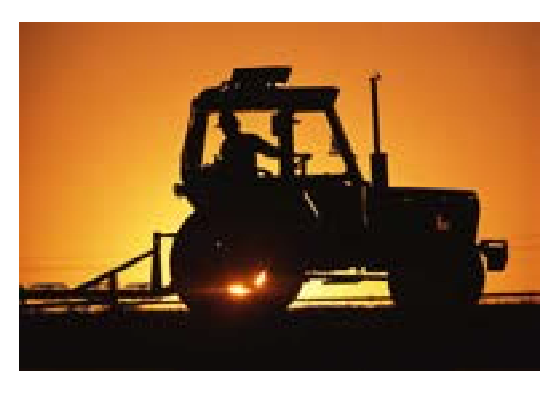
SWEPCO 709 Universal Tractor Transmission/ Hydraulic Oil is especially formulated to provide superior performance in agricultural hydraulic systems, transmissions, power take-off units, final drives and wet brake systems.

SWEPCO 709 is also a multipurpose hydraulic oil intended for use in hydraulic systems, transmissions, power take-off units, final drive units and wet brake systems. Because of its ability to meet these many varying needs of a great number of major equipment manufacturers, SWEPCO