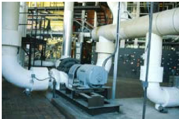
SWEPCO 708 Premium R&O Industrial Turbine Oil is capable of reducing operating temperatures as much as 20% and electrical requirements as much as 13% in a wide range of industrial applications.

Provides clean, efficient, long-lasting service in all types of equipment including sump, mist and oil circulating systems and systems operating at