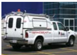
SERVICE & UTILITY FLEETS

Keeps fuel systems clean for maximum power & fuel economy . . .