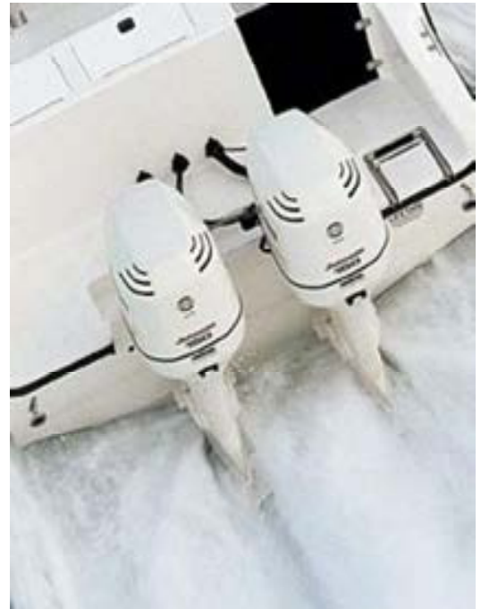
SWEPCO 313 provides unexcelled protection and cleanliness.

SWEPCO 313 TC-W3 is designed for use in engines featuring more advanced technology and extends the previously proven TC-W/TC-W2 technology and beyond. It provides an extra margin of lubrication safety which