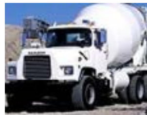
Extreme pressure applications

Enjoy better performance, longer drains and maximum gear box life with SWEPACO 203.