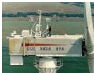
High shock applications