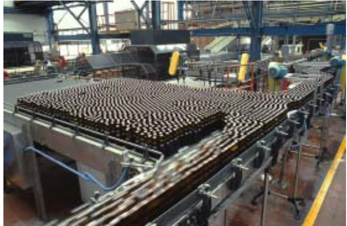
SWEPCO 116 Ultra EP Food Machinery Grease is a premium quality food grade grease rated for use wherever incidental contact with food can occur.

With the NSF H-1 approval and exceptional performance SWEPCO 116 Ultra EP Food Machinery Grease is ideal for use throughout the plant. SWEPCO 116 will help reduce the number of greases needed and lubrication errors. It can be