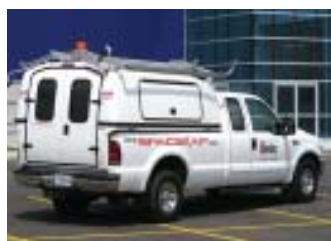
SERVICE & UTILITY FLEETS

Keeps fuel systems clean for maximum power & fuel economy . . .